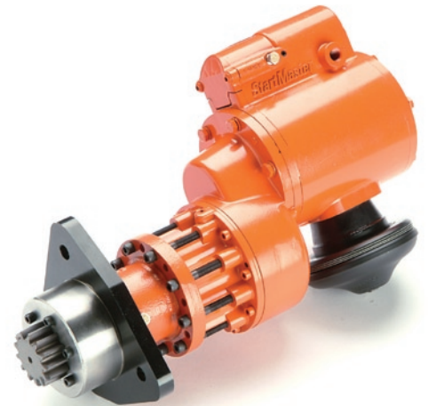
SM-251-Pre Engaged, Overhung

Both the SM-250 and SM-251 features a choice of built in, lubricator, relay valve and muffler. This reduces the hose and fittings required by nearly 50 percent.