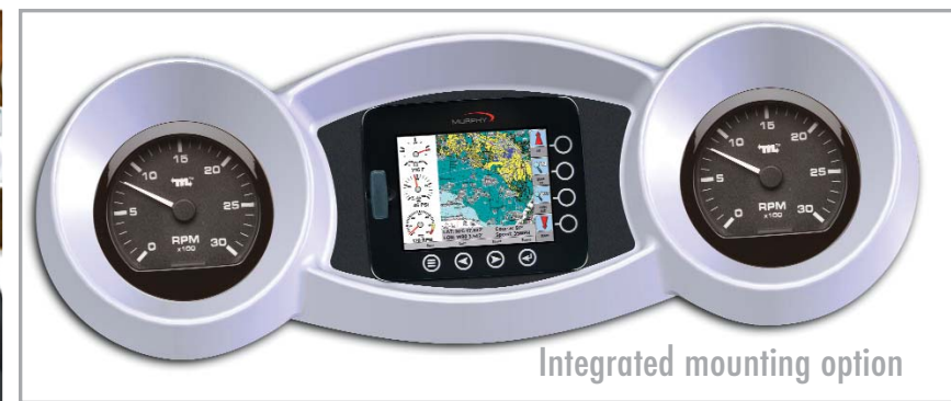
Integrated mounting option